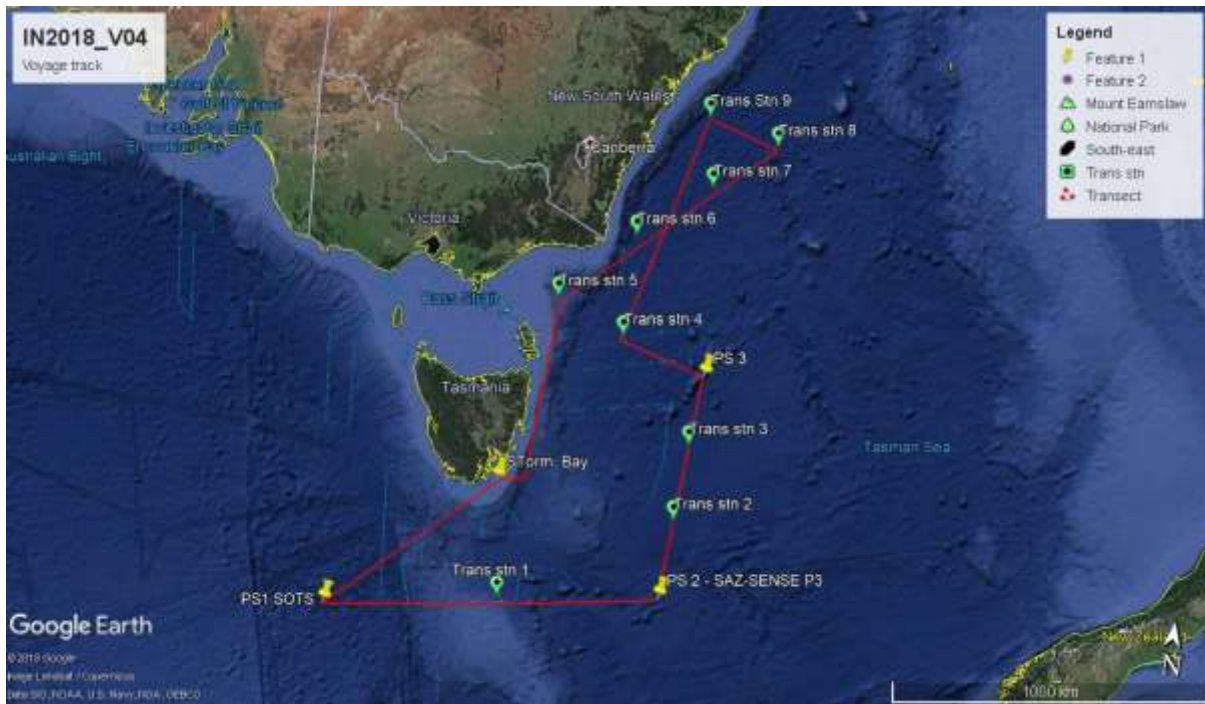
Figure showing the area of operation for IN2018_V04.