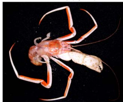
28837804-024-015- Sympagurus-sp. 2.tif