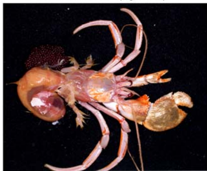
28837803-024-017- Sympagurus-sp. 1.tif