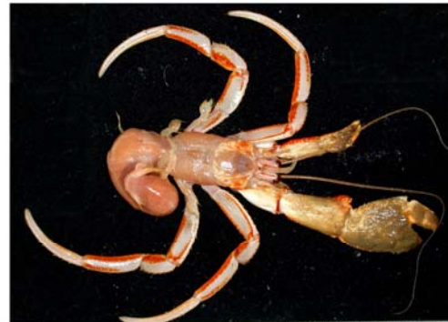
28837803-017-013- Sympagurus-sp. 1.tif