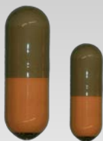
Figure 1. (Left) 1 st generation LHX-Mk1 tag (on left, L 127mm, Ø 42mm, 118g). 2 nd generation LHX-Mk2 tag (on right, L 90mm, Ø 33mm, 65g). Tags are shown in actual size. Mk2 tags are currently under development with NSF funding.

LHX tags are intraperitoneally implanted (Fig. 1,2) and record sensor data throughout the life of the homeotherm host [1,2]. Following post-mortem extrusion, the positively buoyant tags uplink via the Argos satellite system to provide data on time and date of mortality, with spatially and temporally unrestricted resight effort [3].