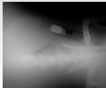
Figure 2. (Above) Dorsoventral abdominal radiograph of two LHX-Mk1 tags implanted into a subadult male California sea lion. LHX tags are intraperitoneally implanted under gas anesthesia and aseptic surgical procedures [2]. Two LHX tags are used per host to increase data return rates, and to quantify event detection probability [3]. From 2004 through 2009, four rehabilitated California sea lions and 32 wild-caught Steller sea lions were released with single (n=4) or dual (n=32) LHX tags.